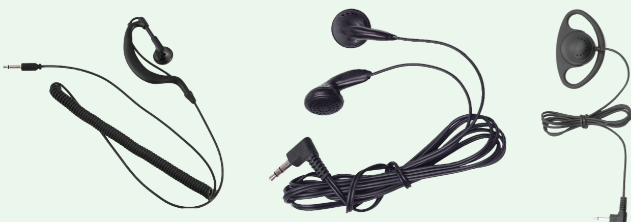
Examples of RSA compatible in-helmet earpieces